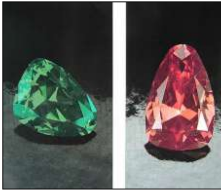
Plate 1: Alexandrite