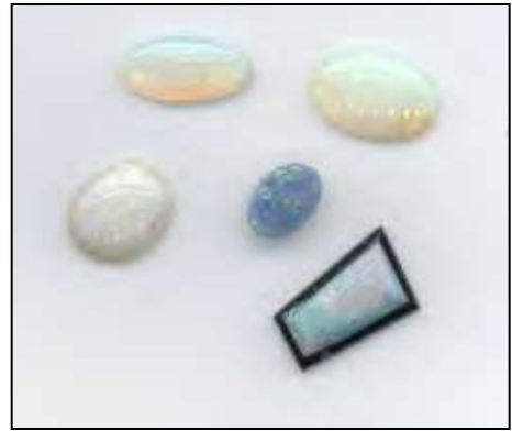
Plate 26: Opal