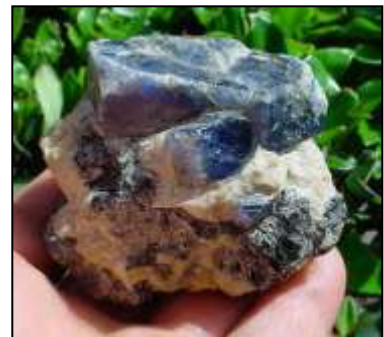
Plate 14: Sapphire, Russia