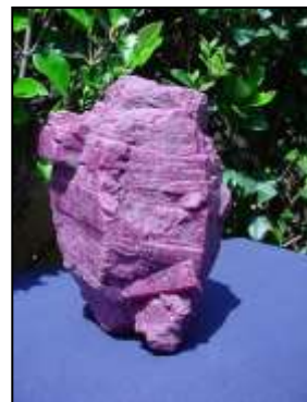
Plate 16: Ruby, India