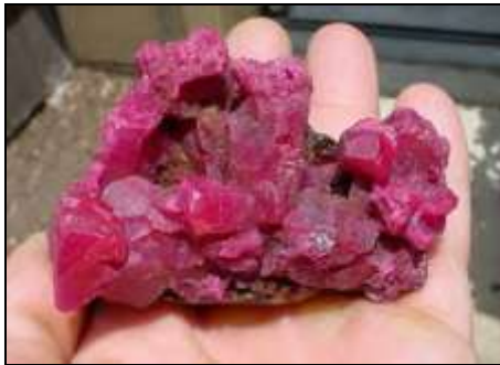
Plate 11: Ruby, Uganda (or Kenya)