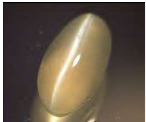
Plate 6: Chrysoberyl Cat's-Eye