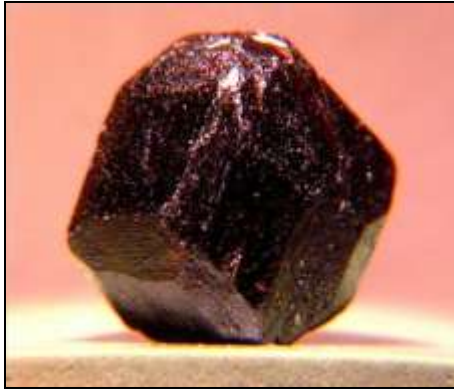
Plate 17: Garnet - Almandine