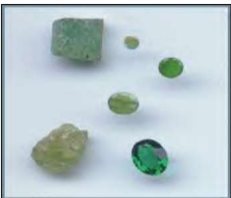
Plate 7: Emerald