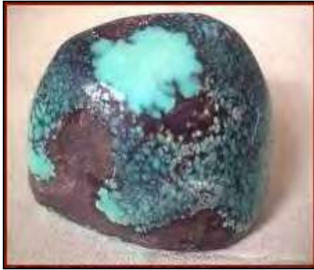
Plate 33: Turquoise (Bisbee, AZ)