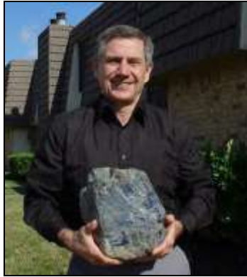
Plate 9: The Author with Sapphire

The plates on this page are illustrations for the corundum article by Will Heierman beginning on page 15.