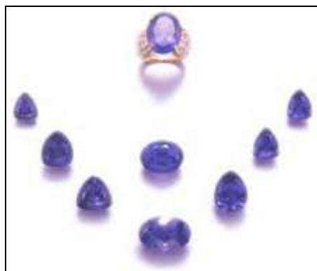
Plate 31: Tanzanite