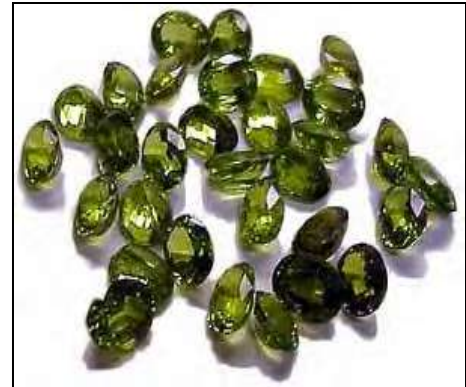
Plate 28: Peridot