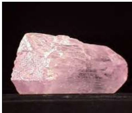
Plate 23: Kunzite