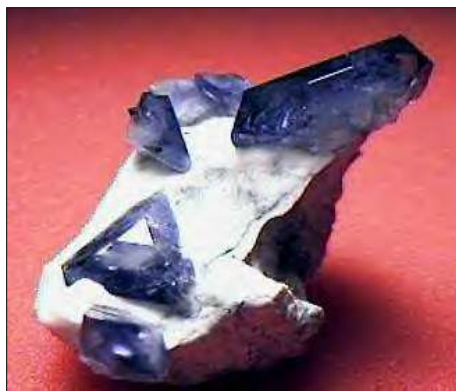
Plate 5: Benitoite