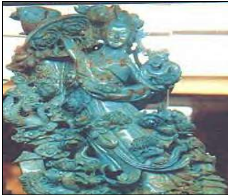
Plate 35: Turquoise (China)