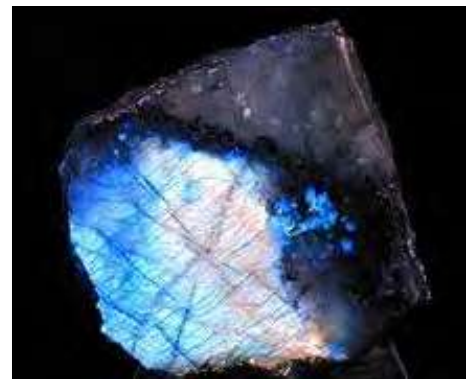
Plate 24: Labradorite