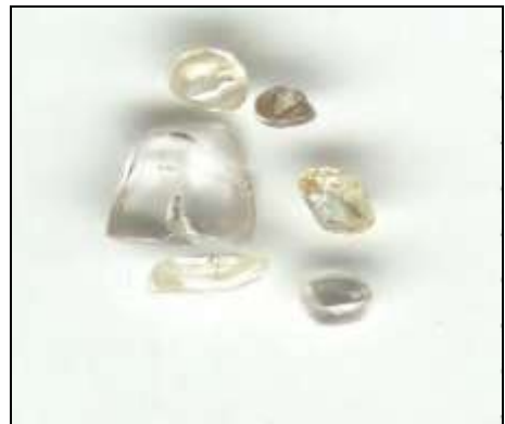
Plate 38: Diamond (Arkansas)