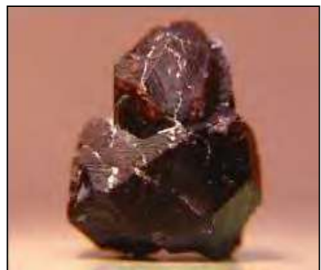
Plate 8: Garnet - Pyrope