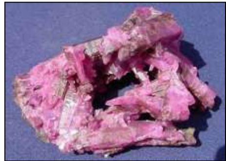
Plate 12: Ruby, Nepal