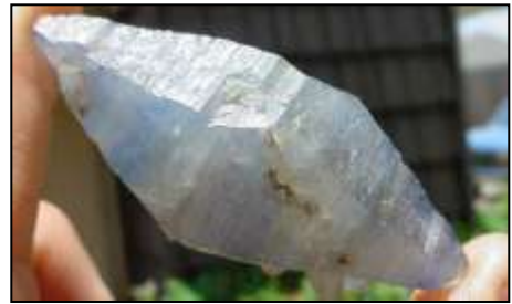
Plate 10: Sapphire, Sri Lanka

The plates on this page are illustrations for the corundum article by Will Heierman beginning on page 15.