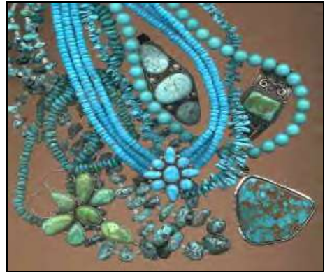
Plate 36: Turquoise (Native American)