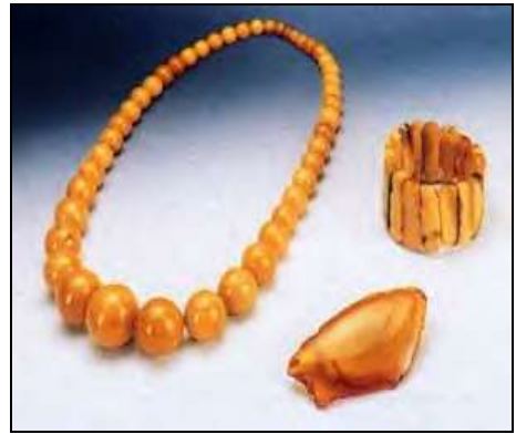
Plate 2: Amber