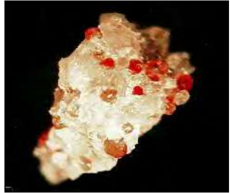
Plate 18: Garnet - Spessartine