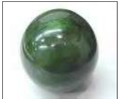
Plate 22: Jade (Nephrite)