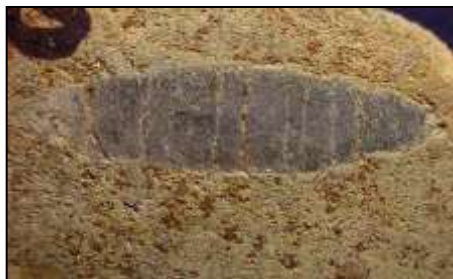
Plate 13: Corundum, California