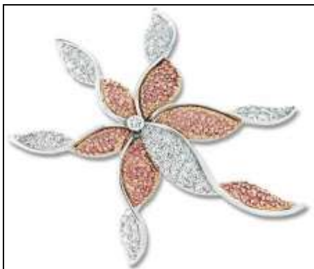
Plate 39: Pink Diamond