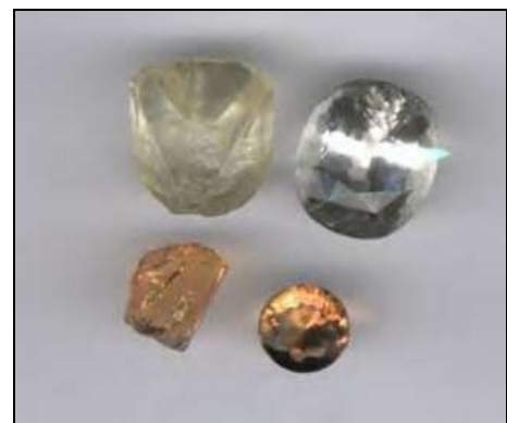
Plate 32: Topaz