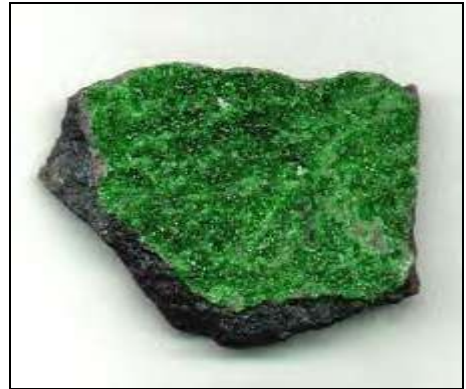
Plate 20: Garnet - Uvarovite