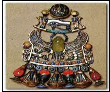
Plate 34: Turquoise (Egypt)