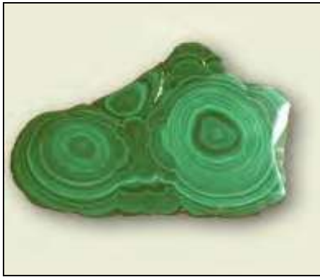
Plate 25: Malachite