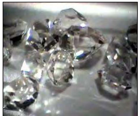
Plate 40: Herkimer "Diamonds"