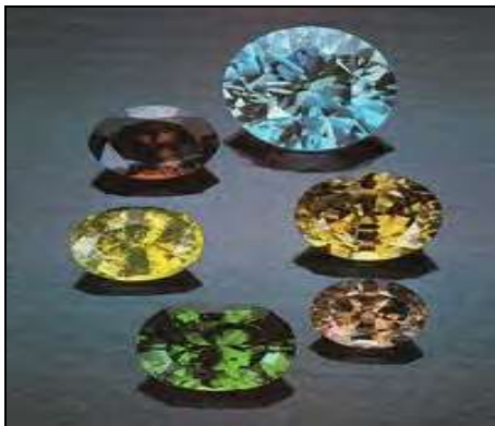
Plate 37: Zircon