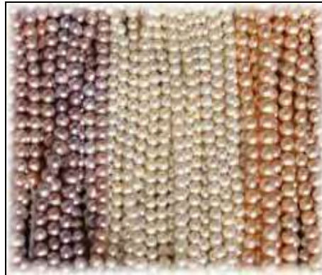
Plate 27: Pearls