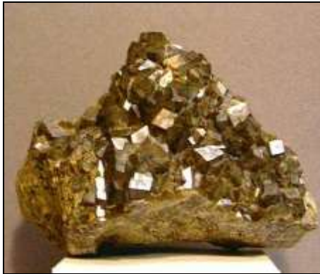
Plate 19: Garnet - Andradite