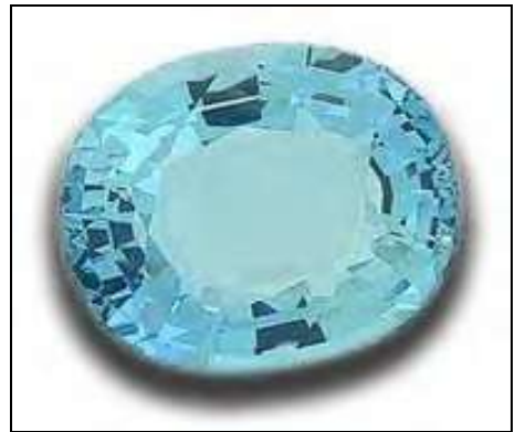
Plate 4: Aquamarine