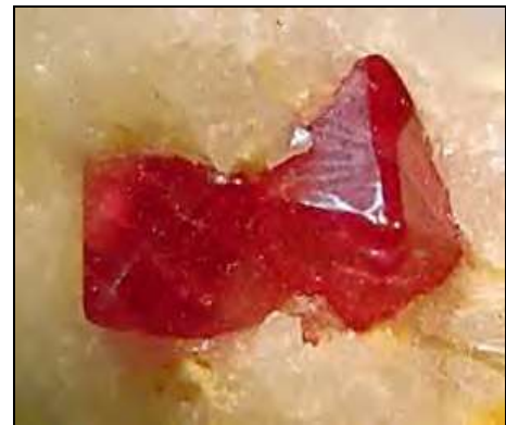
Plate 30: Spinel