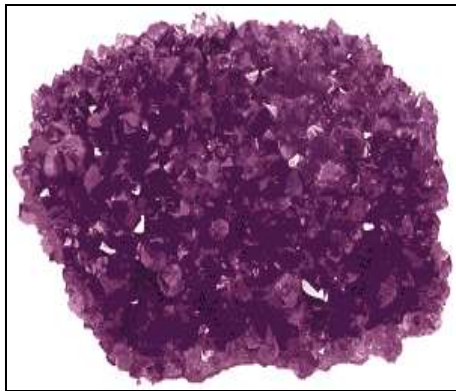
Plate 3: Amethyst