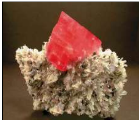
Plate 29: Rhodochrosite